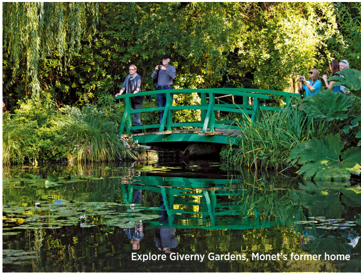
Explore Giverny Gardens, Monet's former home

Experience first-hand the Normandy beaches where the Allied vessels landed, as well as the memorials and museum, which honor the bravery of those involved and their ultimate sacrifice. Your Star-Ship remains docked in Honfleur overnight. Meals: B, L, D