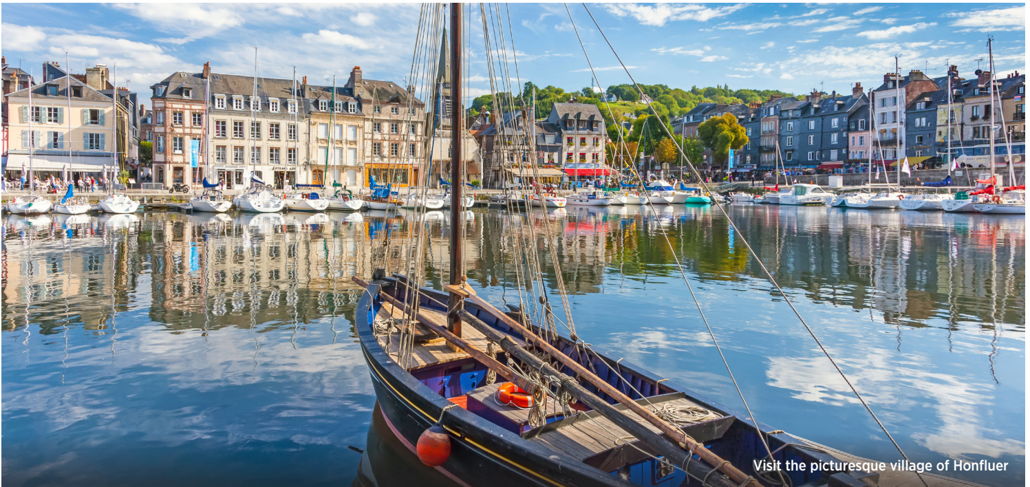
Visit the picturesque village of Honfleur