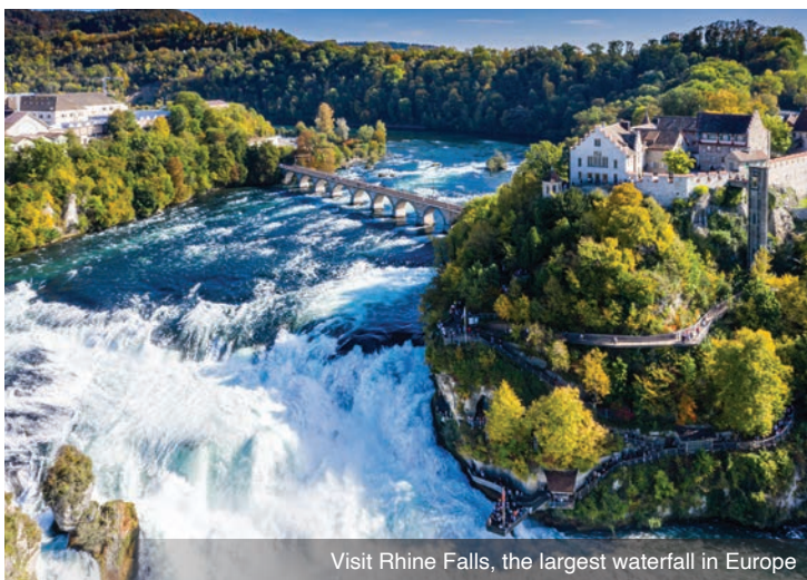
Visit Rhine Falls, the largest waterfall in Europe