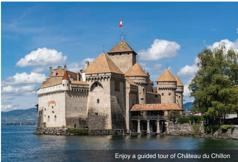
Enjoy a guided tour of Château du Chillon

During free time, walk along the Brunnengasse, a street that earned the title of “the most beautiful street in Europe”, and home to many 18th-century houses with wood-carved embellishments. Return by coach to the hotel with the remainder of the day at leisure. Meal: B