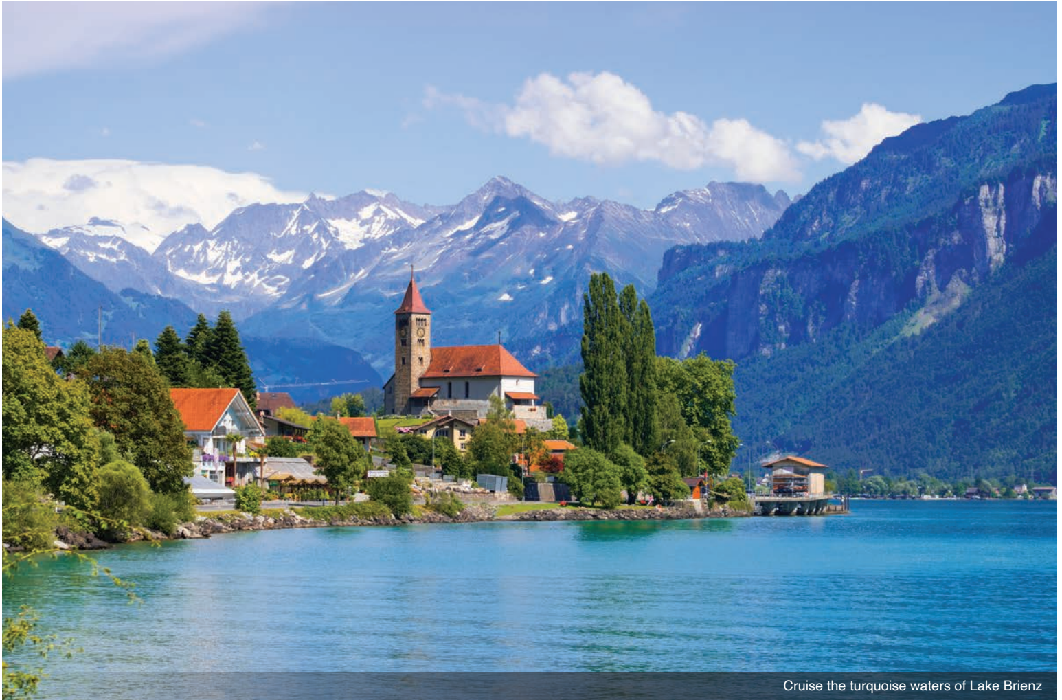
Cruise the turquoise waters of Lake Brienz