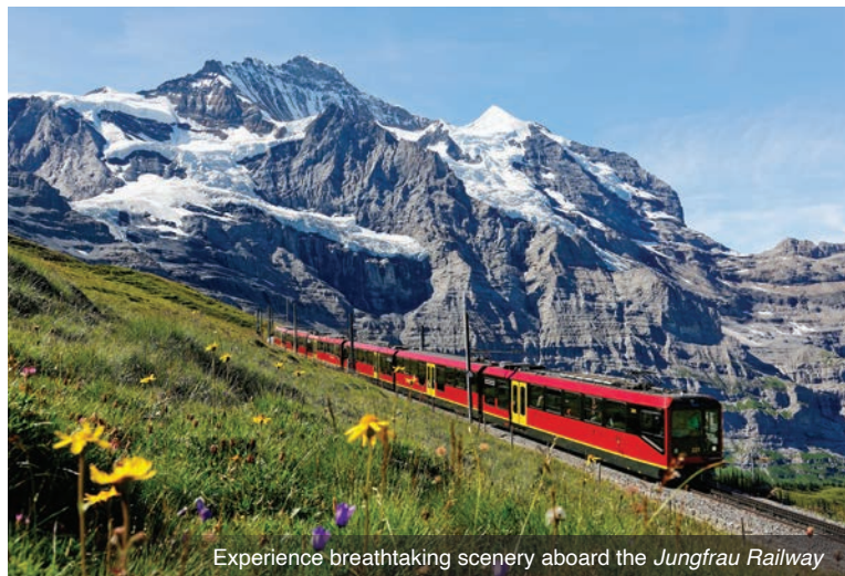
Experience breathtaking scenery aboard the Jungfrau Railway

DAY 1 Depart the USA: Depart the USA on your overnight flight to Zurich, Switzerland.